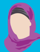
Keski (Small turban)